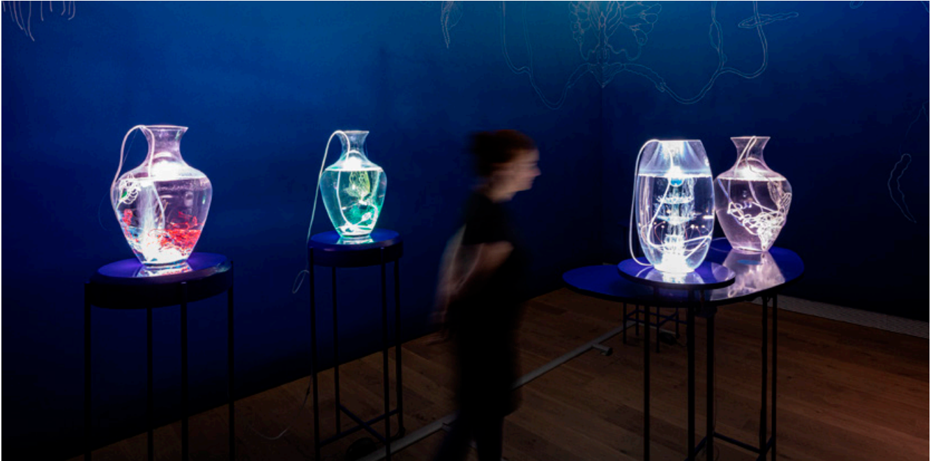
Installation view, Pinar Yoldas: Metabolizing Plastics (2022) Yves Tinguely Museum, Basel Switzerland.

C You Saturday! Opening Reception: February 24, 2024