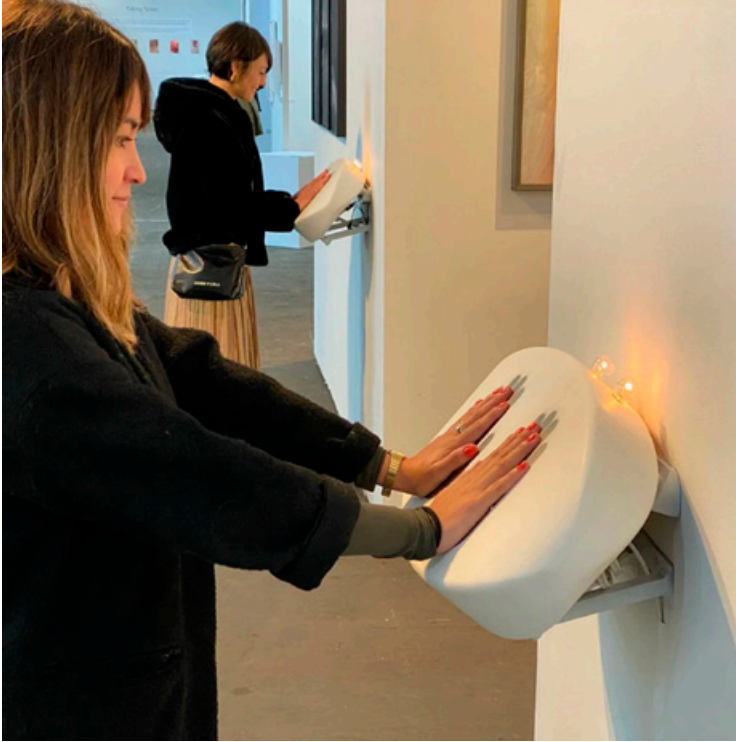
Rafael Lozano-Hemmer, Remote Pulse , 2019.

C You Saturday! Opening Reception: September 21, 2024