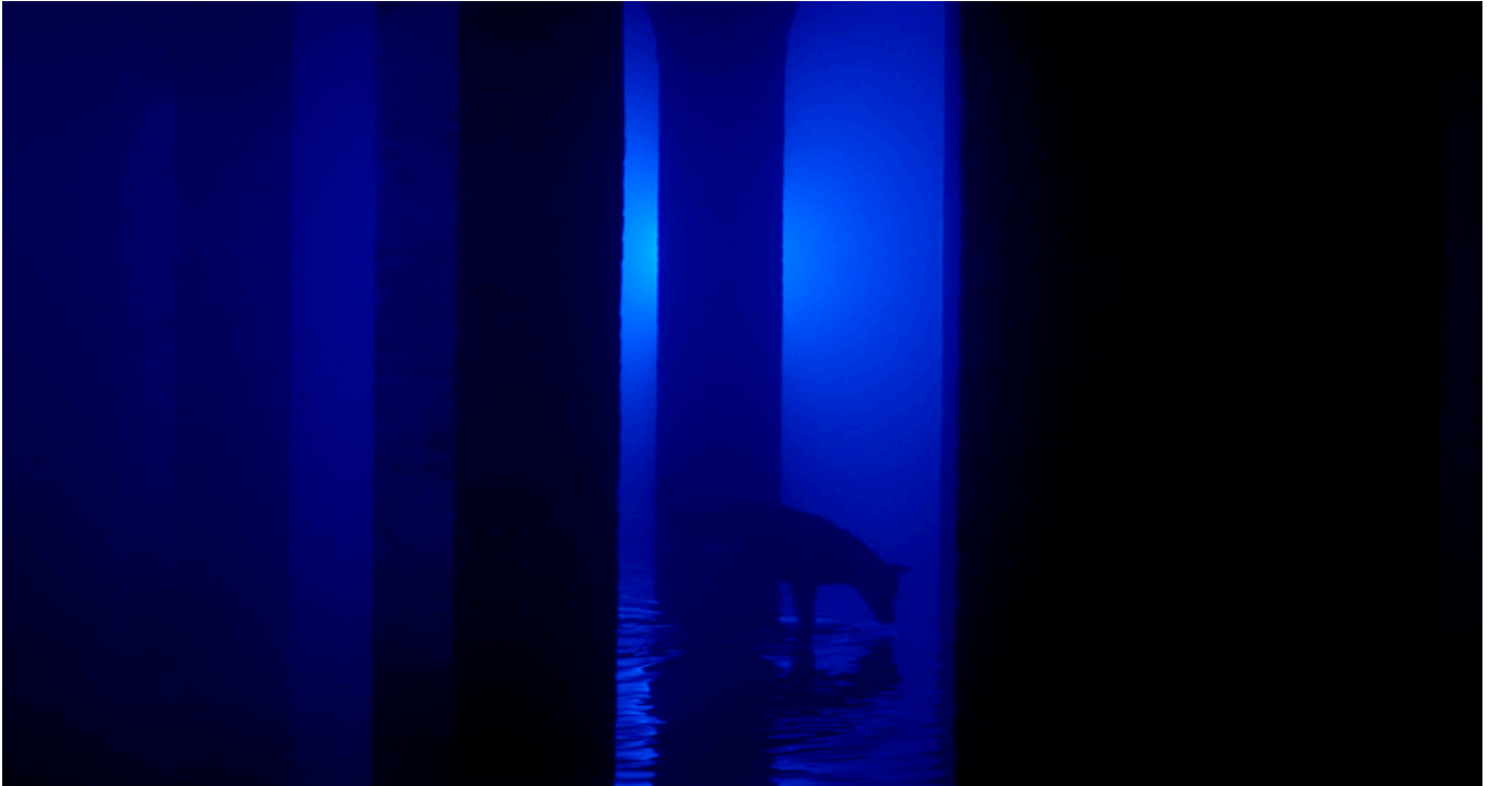
Beyond The End Of The World , 2021. Still image.

C You Saturday! Opening Reception: January 20, 2024