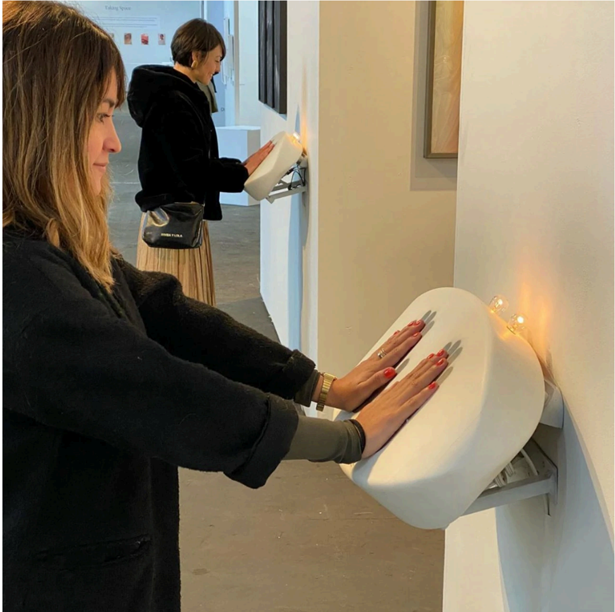
Rafael Lozano-Hemmer, Remote Pulse , 2019.

C You Saturday Opening Reception: September 21, 2024